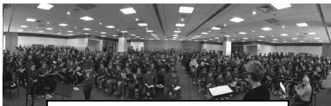
Festival by the Sea 2016 closing worship.

The Chancel Choir is preparing music for the season of Lent, Palm Sunday, Maundy Thursday and Easter Sunday. The Chancel Choir rehearses each Wednesday at 7:15 p.m. Join us this week!