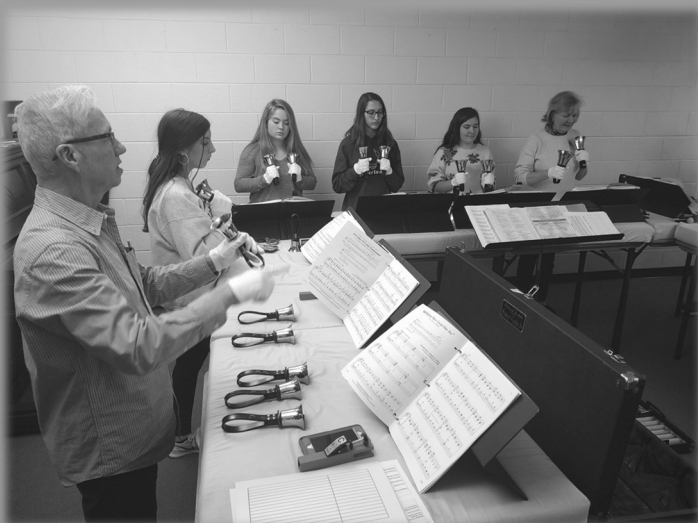
Youth and Adult Handbell "Come Ye Faithful" rehearsals