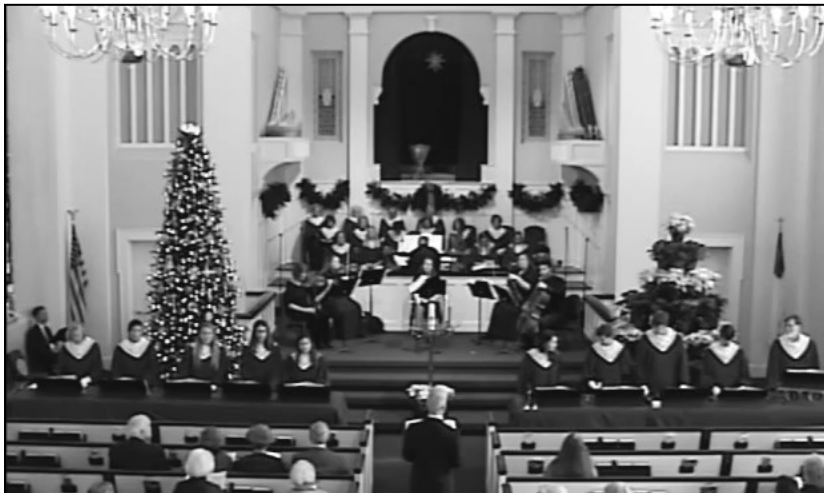
"Come Ye Faithful" participants, December 15, 2019

Youth Choir (for grades 6-12) Sunday, 5:20 p.m.