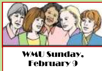
WMU Sunday, February 9