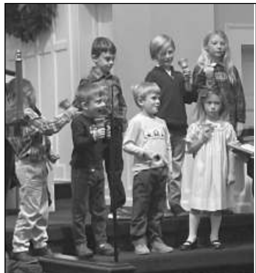
Children's Music Activity Group Singing for Hanging of the Greens