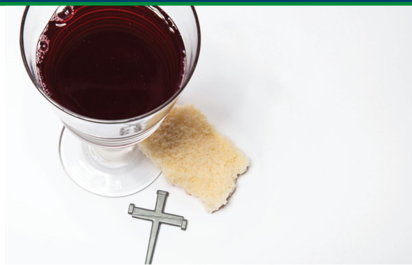
Christmas Eve Candlelight Communion, 5:00 p.m.

The Chancel Choir and Youth Choir presents "How Far Is It To Bethlehem?" Sunday, December 13, 11:00 a.m.