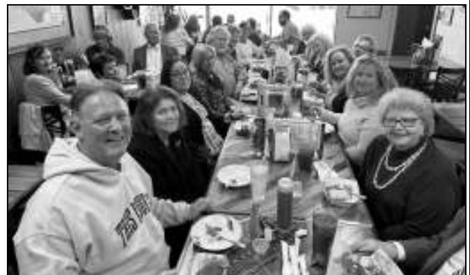
Lunch at Ana’s Tex Mex (left), and Penn’s Grill (right).